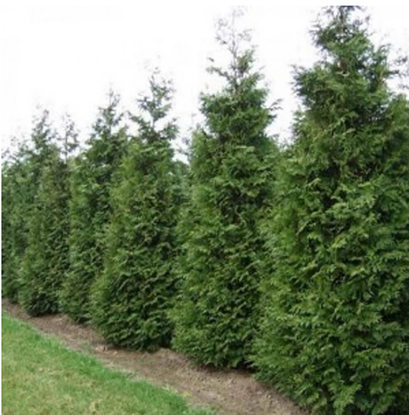
Eastern White Cedar