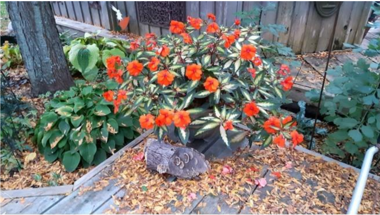
Great Fall Colour