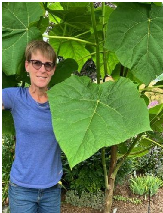
MJ with a giant Royal Empress leaf

Gary is going to share with us some new science on how plants function with respect to how they get their nutrients and what you can do (or perhaps not do) to allow them to thrive.