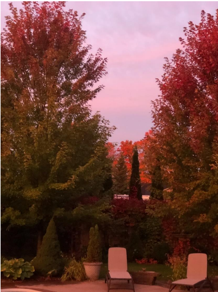
A Stunning Fall "Pink Sky" Morning

[ Do you have a story or picture to share? We LOVE getting newsletter input from members.