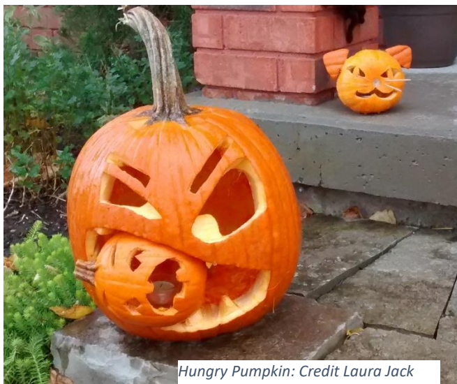
Hungry Pumpkin

At our AGM in November, we're going to be thanking two of our long-standing board members who are coming to the end of their 2 year terms as directors of the PHS. We'd be thrilled if some others would be interested in joining us. In particular, we're looking for someone with an interest in newsletters and communications in general. Computer skills are a definite asset! We're a fun bunch. If you're looking for more info, just let us know: ptbohortsoc@gmail.com .