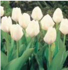
White Emperor –