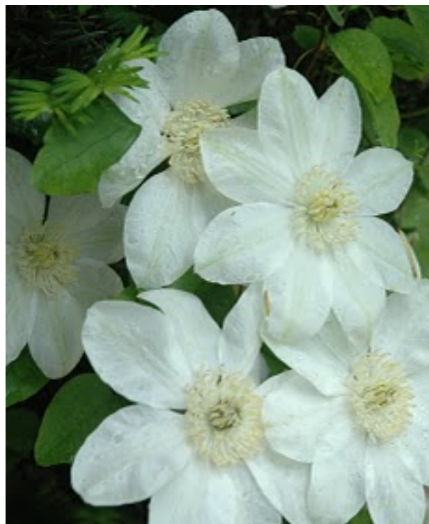
'Guernsey Cream' is a climbing clematis with large white flowers often tinged with green.